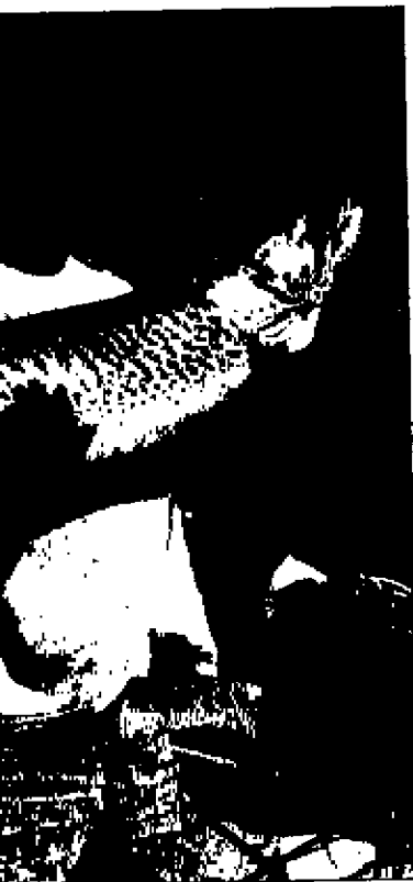
36-pound musky he caught last summer.

(lures) for sale – all different models, makes and sizes. Most of them are designed for musky fishing. I probably have more musky gear than anyone else around.”